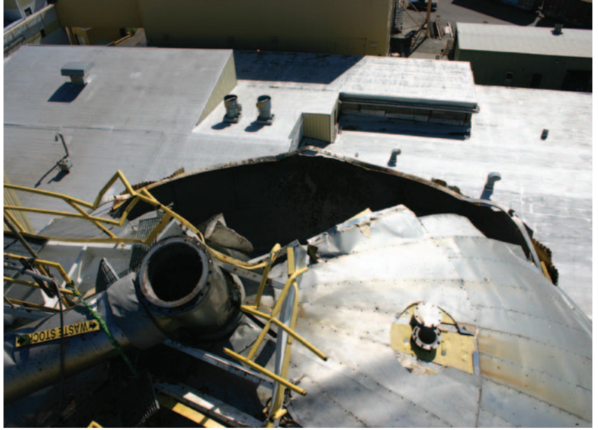
Views of the storage tank involved in the 2008 explosion at Packaging Corporation of America.