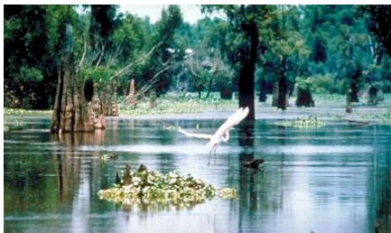
Atchafalaya Basin Scene