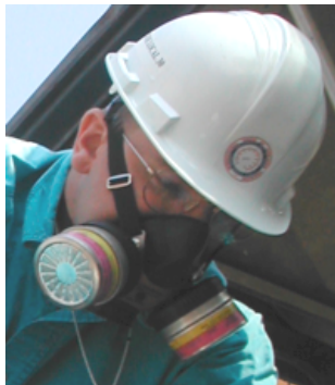
½ face respirator with P-100/OV/AG cartridges

If in doubt about respirators, see your Supervisor!