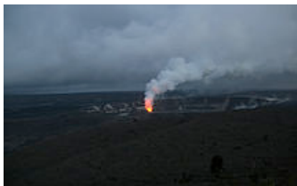
SO 2 Plume