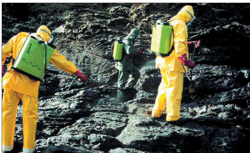
Appropriate PPE must be used when using dispersants.