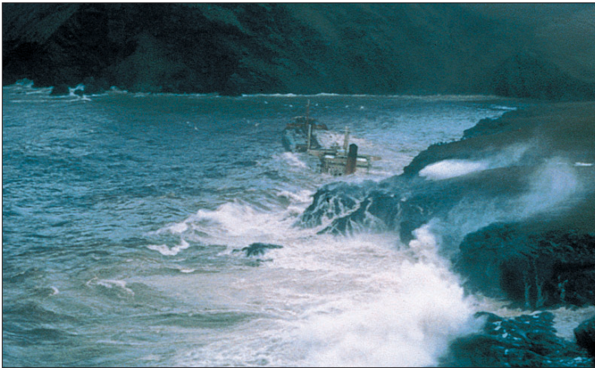
The natural environment can present a significant risk.

Although indigenous flora and fauna are often an important ecological and environmental resource, they can present a very real safety issue. Poisonous plants and dangerous animals need to be identified, and their appearance publicized to the responders along with information on how to deal with the threat they present. Of greater concern are those creatures that may actually attack humans both in the sea and on dry land. Where these possibilities exist, expert advice must be obtained and adequate protection provided.