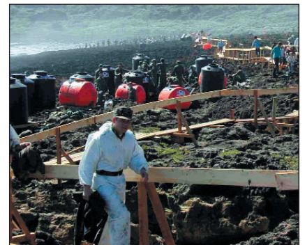
Providing safe access to the worksite is critical to reducing the risk of accidents.

As mentioned previously, the most common hazard to responders is the danger from slips, trips or falls. Oil spills can occur in locations where the access to the work site is difficult. The problem is compounded when the surface is coated with oil, but rocky shorelines can be naturally slippery due to seaweed, wet rocks or mud. Safe and secure access must be provided for the workforce to prevent the possibility of injury. When working on the shoreline, it is advisable for responders to keep clear of cliffs or rocky shorelines until a safe means of access has been provided, either in the form of access bridges or guide ropes. Clean-up crews should be warned of the hazards of any particular site access and be given