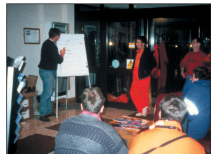
Briefing the response team prior to a day's operations