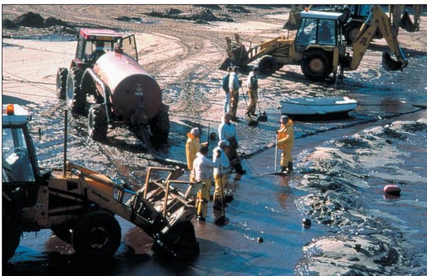
Shoreline clean-up operations need to be managed carefully to prevent accidents.

It is essential that shoreline responders are trained to recognize the hazards present in their working environment, and are provided with adequate means to control the risks.