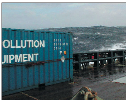
High seas conditions can make vessel operation hazardous.

increased risk when operating offshore and, where possible, regular local workers acting as safety escorts should accompany them. A personal floatation device must be worn by all responders working offshore and in vessels, because swimming ability is impaired by clothing such as boots and helmets. Vessels engaged in offshore response work should be suitably sized and equipped to deal with the environment. Adequate and suitable safety and communications equipment should be installed on the vessels. Crews should be trained and competent in the operation of the vessels and responders should be trained and fully briefed on their responsibilities.