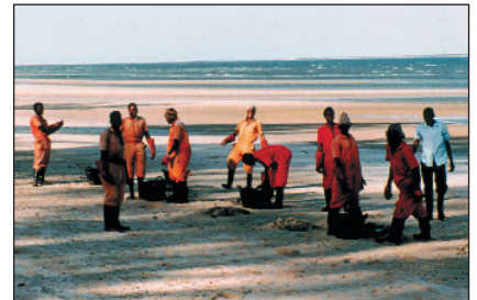
A properly equipped, well motivated team is a major asset

The working environment will often dictate the PPE selection criteria. For example, cold weather environments require the use of thermally insulating clothing. This type of clothing can be rendered unusable if it comes into contact with liquid oils, hence a robust and well-sealed impermeable layer should be worn above the cold weather clothing. Conversely, in hot climates, impermeable clothing will exacerbate the problem of heat stroke. Workers should therefore be given adequate rest breaks and liquids to ensure their welfare, or an acceptable compromise should be reached in the type of PPE that they wear.