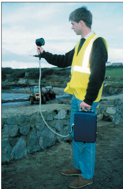
Conducting air monitoring in the vicinity of the spill site.

The most common form of accident encountered during spill operations results from slips, trips or falls. Many of the products encountered are, by their very nature, slippery. Slips, trips and falls on oiled surfaces are one of the main causes of injury and awareness of these hazards should be raised. Responders can also find it difficult to handle equipment when wearing oily gloves, which can increase the time taken to complete familiar tasks and may make some more complicated tasks impossible without decontaminating the equipment first.