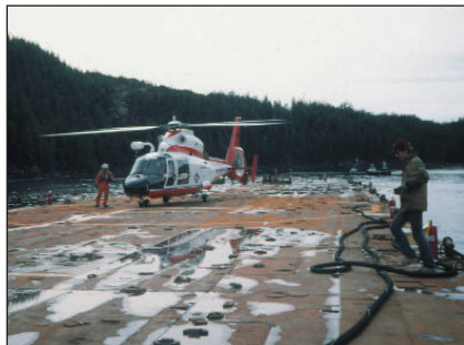
Aircraft can play a significant role in response operations.