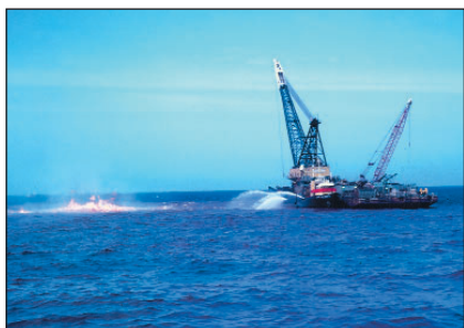
Some spills present specific safety risks

Responses to oil spills inevitably put responders and chemicals together in the same environment. Potential exposure of personnel should be assessed, monitored, and controlled if health effects are to be avoided. Each type of product, when spilled into the environment, will have its own set of chemical characteristics that will determine the most effective response strategy and, indeed, which strategies are safe to use. It should be borne in mind that the chemical characteristics of the spilled product will usually change over a period of time as a result of what is known as ‘the weathering process’, i.e. the action of the elements on the product and its reaction with the surroundings.