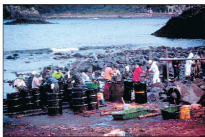
Volunteer activities must be coordinated and the safety aspects managed.