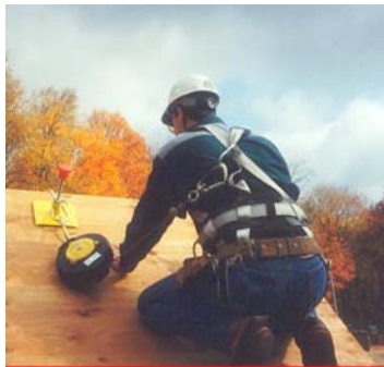
Figure 13 - A worker using a reusable anchor with a retractable lifeline.