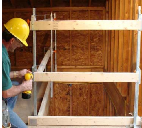
Figures 21 & 22 - Examples of guardrails installed around floor openings.