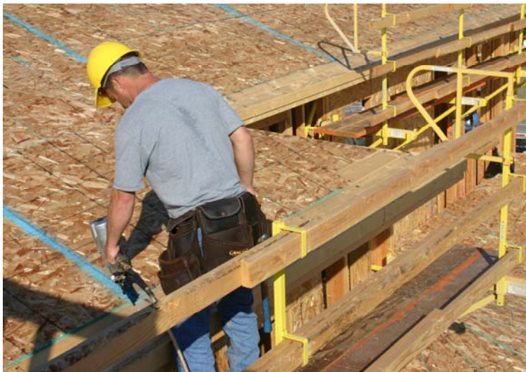
Figure 8 – A worker sheathing a roof from a bracket scaffold.

A bracket scaffold can be attached to the top plate of a structure. The scaffold can provide a secure work platform from which to install roof sheathing.