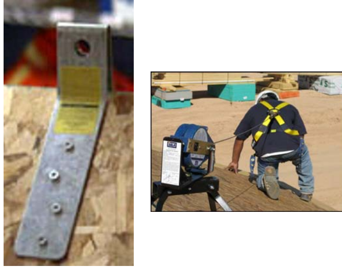
Figure 9 - Anchors that can be used while performing roof sheathing operations.

Anchors and retractable lifeline stands can be used by workers installing roof sheathing.