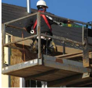
Figure 30 - Worker performing residential construction activities from an aerial lift.

Aerial lifts may be used for wall sheathing work. In particular, boom type elevating and rotating aerial work platforms can offer positioning flexibility and provide stable elevated platforms.