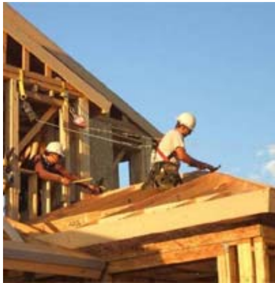
Figure 5 - Strap anchors providing anchorage for three personal fall arrest systems.

Employees installing ridge poles and rafters can use strap anchors and bolt-on anchors. These anchors can be used with personal fall arrest systems and fall restraint to provide fall protection for workers engaged in this activity. Both anchors can be removed and reused according to the manufacturer's instructions.