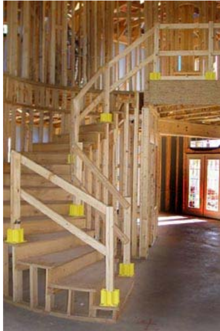
Figure 33 - Wooden guardrail system for a stairway.