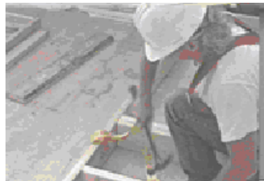
Figures 25 & 26 - Reusable anchors