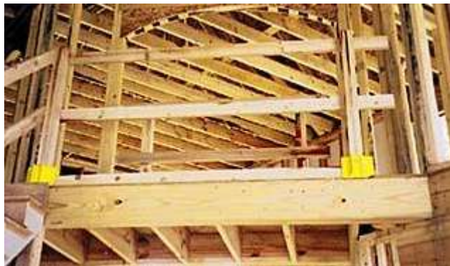
Figure 34 - A landing protected by a wooden guardrail system with a toeboard.