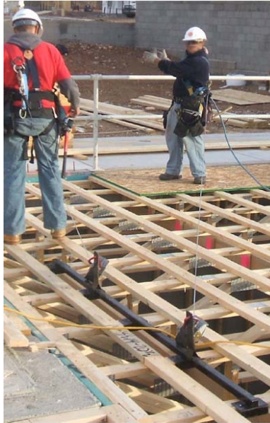
Figure 20 - Workers using a truss bracket anchor while installing a subfloor.

A truss bracket anchorage system can distribute the arresting forces across multiple trusses in the event of a fall. When appropriately installed in accordance with the manufacturer's instructions, these anchors can be used with personal fall arrest systems and fall restraints. Because these anchors are reusable, they can be uninstalled and reinstalled in accordance with the manufacturer's instructions.