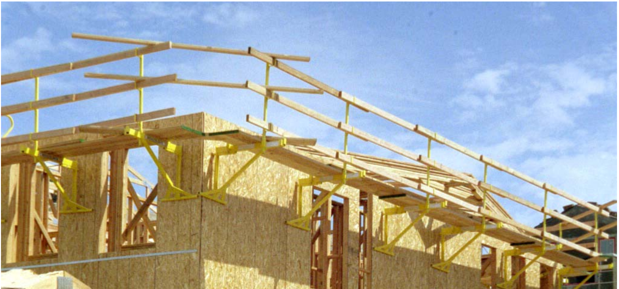
Figure 19 – A scaffold rigged for installing floor joists and floor trusses.

Wall bracket scaffolds can be used on a residential structure once a wall has been completed. These scaffolds can provide access around the perimeter of the structure and can be used by workers while they install carrier beams, floor joists, and floor trusses. This type of scaffold can also be used in other phases of residential construction.