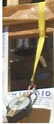
Figure 24 - A reusable strap anchoring a retractable lifeline.

Some models of strap anchors are looped through soft eyes or larger D rings and can be uninstalled, moved, reinstalled and reused following the manufacturer's instructions.