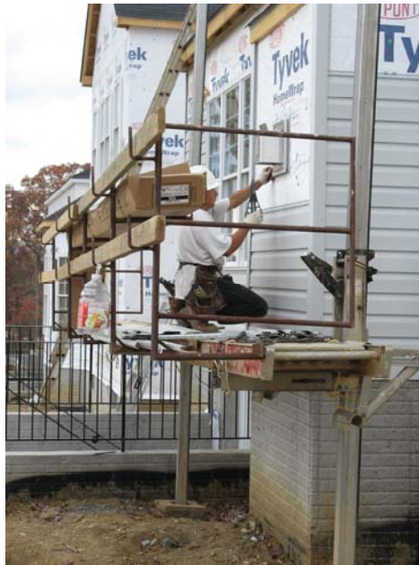
Figure 32 - A worker performing siding activities from a pump jack scaffold.

Pump jack scaffolds consist of a platform supported by moveable brackets on vertical poles. Pump jacks are appealing for certain applications because they are easily adjusted to variable heights, and are relatively inexpensive. They can include a material shelf for carrying supplies and tools.