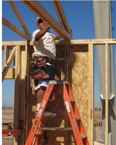
Figure 3 - Platform ladders can be set up inside a structure and used to install roof trusses.

Platform ladders and step ladders can provide a stable, elevated platform from which to work.