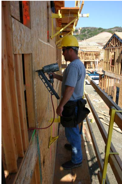
Figure 29 – A worker sheathing walls from an exterior bracket scaffold.

Exterior bracket scaffolds can provide a work surface from which to attach sheathing to the frame.