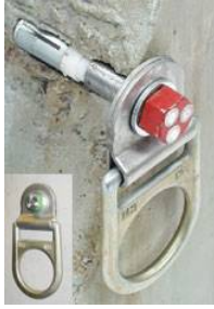
Figure 14 – A cutaway picture of an anchor with an expandable bolt for use in concrete.

Strap anchors can provide versatility and options for anchorage points while performing this type of work. Strap anchors can be looped over rebar and removed when no longer necessary.