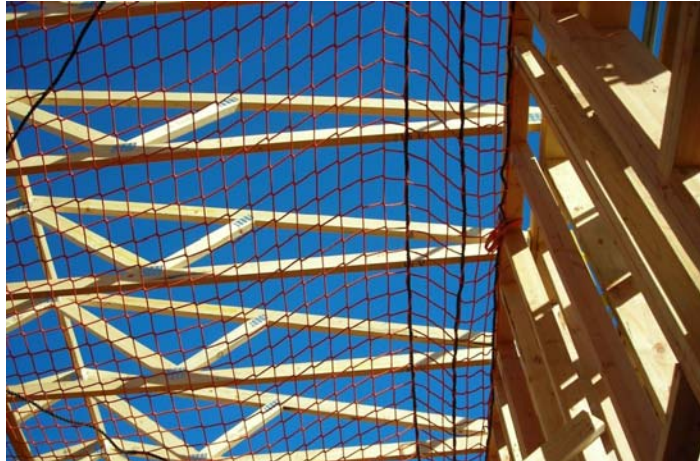
Figure 7 - An example of a safety net system.

Safety net systems can be used as fall protection for workers installing roof sheathing.