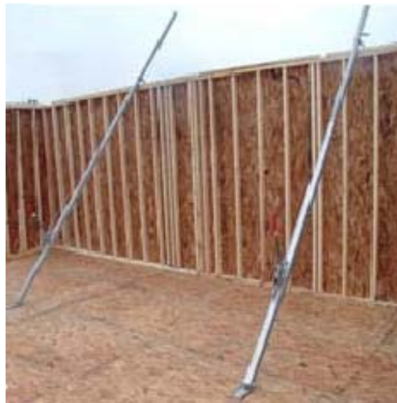
Figure 23 - Framed walls being erected using a jack.

Framed wall sections usually are constructed on the ground and typically include sheathing and openings for windows and doors. Guardrails across these openings can help prevent falls while work is being performed in the house after the walls have been erected. These walls can be erected by using a lifting device such as a crane, boom truck, or forklift. Jacks can also be used to raise these walls. These practices greatly reduce the likelihood that a worker will be exposed to a fall during this stage of construction.