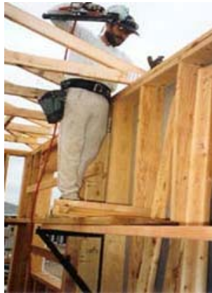
Figure 1 - A worker installing roof trusses from an interior bracket scaffold.

A bracket scaffold can be placed on the interior or exterior of a structure. The scaffold can provide a stable working platform. When bracket scaffolds are used on the interior of the structure, the exterior wall can limit employee exposures to fall hazards.