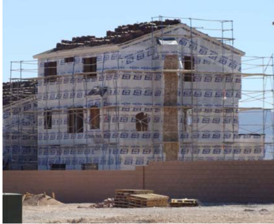
Figure 28 - Welded end frame scaffold.

Exterior bracket scaffolds can provide a work surface from which to attach sheathing to the frame.