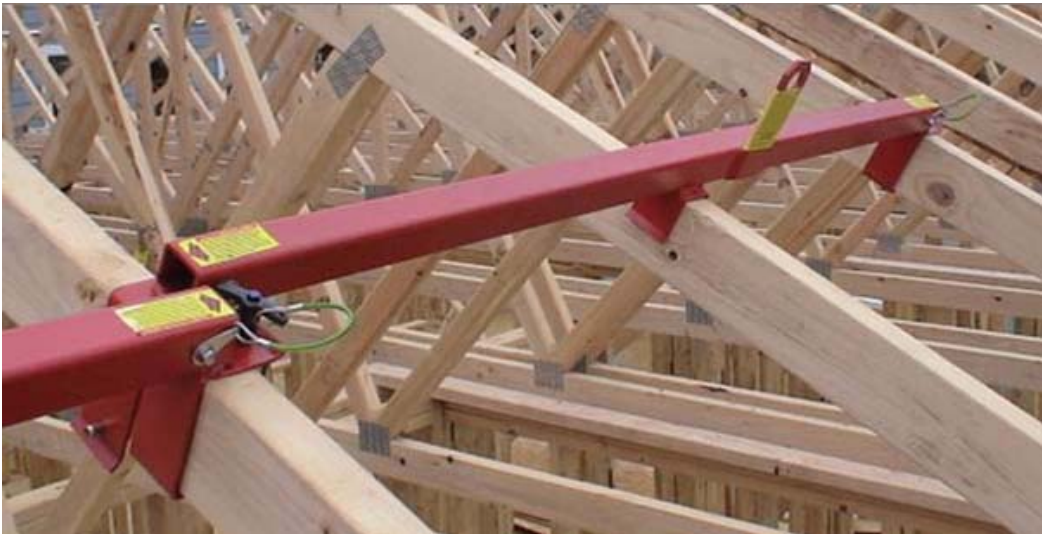
Figure 4 – An example of a spreader attached to roof trusses.

A spreader braces the trusses and distributes arrest forces across several trusses. Spreaders can act as anchors for personal fall arrest systems and fall restraint. They can be reused according to the manufacturer's instructions. It is important to refer to the truss manufacturer's instructions and have a qualified person determine if trusses will meet strength requirements for a personal fall arrest system or fall restraint system.