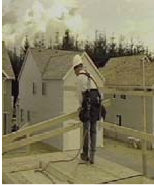
Figure 27 - Worker installing guardrails.