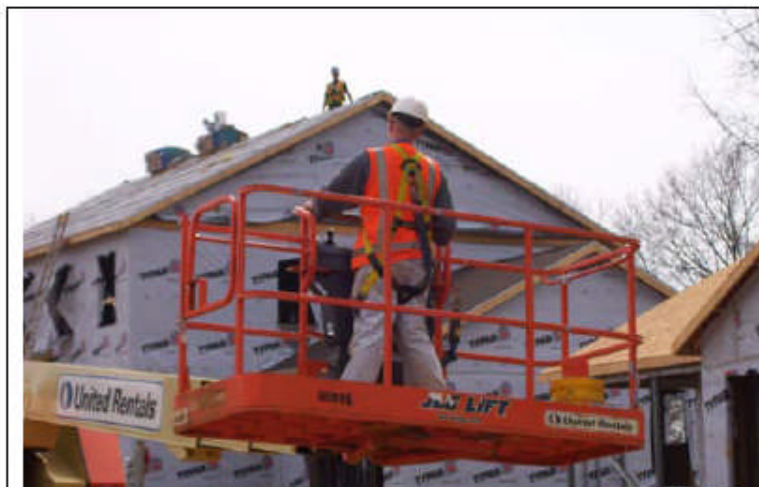
Figure 31 - Worker positioning an aerial lift.

Aerial lifts can be ideal equipment for exterior finishing. By providing a stable, level work surface and positioning flexibility, an aerial lift can be used for numerous activities associated with finishing the exterior of a residential construction structure.