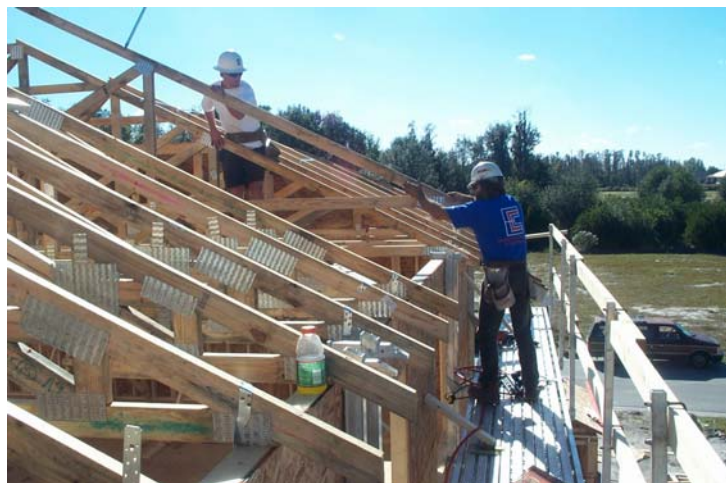
Figure 2 - Workers using an exterior bracket scaffold to install roof trusses.

Exterior bracket scaffolds can also be used for installing roof trusses and other rooftop construction activities. The guardrail system on the scaffold can provide fall protection. With the addition of toeboards, falling object protection can be provided to the areas below.