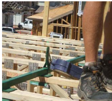
Figure 17 - A retractable lifeline attached to a floor truss anchor.

A reusable floor truss anchor can act as a temporary truss brace and spacer as well as an anchor point for a self-retracting lifeline. The device can spread shock loads over multiple trusses. These kinds of anchors can be uninstalled, moved, reinstalled and reused as per the manufacturer's instructions.