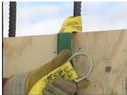
Figure 15 - A worker placing a strap on anchor over rebar.

Strap anchors can provide versatility and options for anchorage points while performing this type of work. Strap anchors can be looped over rebar and removed when no longer necessary.