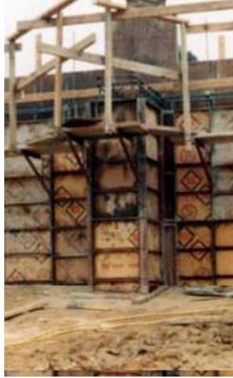
Figure 16 - A bracket-form scaffold attached to formwork.