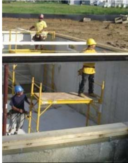
Figure 18 - Workers installing a steel beam from a mobile scaffold.

Mobile scaffolds can be used effectively for residential construction workers. These scaffolds can be placed on the cured concrete basement floor of a structure. From the elevated platforms of the mobile scaffold, workers can install carrier beams, floor joists, and floor trusses.