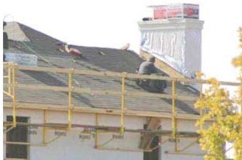
Figure 10 - An exterior bracket scaffold with guardrails being used to protect workers while weatherproofing.

An exterior bracket scaffold can be used for workers weatherproofing a roof. Bracket scaffolds can be especially useful for installing materials along the edge of the roof. Some exterior bracket scaffolds can be used as catch platforms to prevent workers from falling six feet to the lower level.