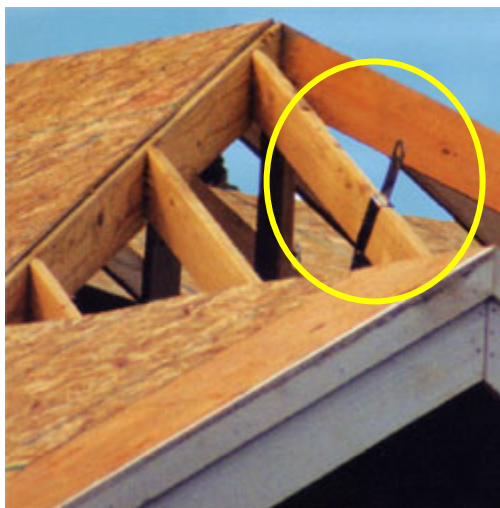
Figure 6 - A bolt-on anchor attached to a rafter.