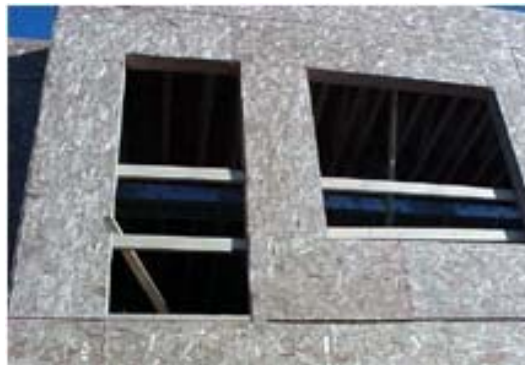
Figure 35 - Guardrails protecting window openings.